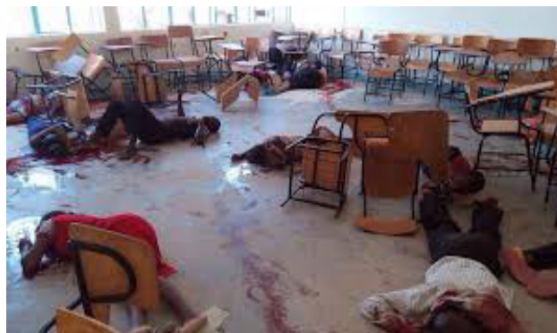
An image showing Garissa University College (Kenya) after the attack

The Garissa University attack happened on 2nd April 2015 at 05:30 (local Kenyan time) (UTCT 03:00) targeting non-Muslim students. Its characteristic features were hostage taking and mass shooting. The motive of the Al-shabaab was Islamic, extremism and territorial claims. A spokesman for the group said that his men released Muslims but held Christians hostage. He further reported that the militant’s mission was to kill those against the ‘Shabaab’ and that ‘Kenya is at war with Somali in reference to the deployment of Kenyan troops in Africa Union Mission in Somalia (AMISOM). Another spokesman asserted that Al-shabaab attacked the institution because it was “on Muslim land colonized by non-Muslims” Later Al-shabaab issued a statement in English targeting the Kenyan public. Part of the statement warned, that Kenyans would be targeted in their workplaces, residences, schools and Universities for condoning oppressive government policies and by failing to speak out against them as well as reinforcing their policies by electing them.