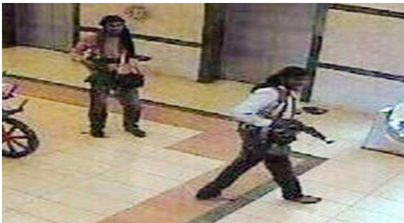
An image of the attackers inside the Westgate shopping Mall as captured on CCTV

The attack on the upmarket Westgate Shopping Centre in Nairobi unfolded at around noon in Kenya when the building was packed with shoppers and people having lunch. The Multi-storey Mall was said to have been attacked by Muslim militants. According to some reports, the attackers attempted to separate Muslims and non-Muslims using Koranic phrases. Victims narrated how some Muslims were allowed to leave the Mall unharmed. Below is an image of the attackers inside the mall.