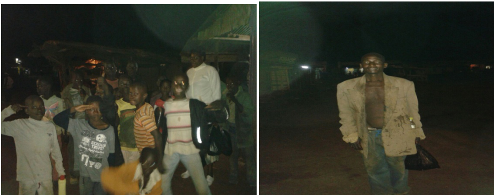
Figure 1: Unsafe environment for street children in Mumias County, Kenya

Common sexual and reproductive health problems included sexually transmitted diseases, HIV/AIDS, unwanted pregnancies and unsafe abortions. Constant physical and mental strain and living in environment least protected against health hazards makes street children highly prone to infectious diseases.