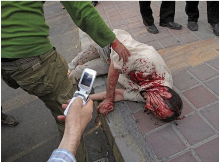
An image showing the Charlie Hebdo Attack in Paris – France

avenged the prophet Muhammad” and “God is Great” in Arabic. Later, two Jihadist flags were found in the getaway car that the two gunmen used to escape from the scene of attack. One of the two gunmen was a convicted Islamic who had been jailed in 2008 for Militant activities. Below is an image of the attack.