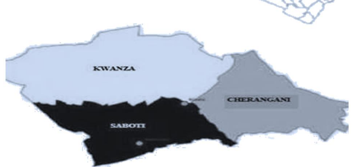
Fig. 1: Map of Trans Nzoia County showing the location of the study area (Source: Adapted and modified from Microsoft Encarta 2008).

The study was carried out in Trans-Nzoia (Fig. 1) at an altitude of 1,900 meters, a latitude of 1°1'8.72"N, and longitude of 35°0'8.3"E The main activity in the area is crop farming and livestock husbandry. The climate is generally warm and temperate. There is a bimodal rainfall in Kitale and averages 1097 mm annually, with precipitation even during the driest month. The average annual temperature is 18.3 °C. The area has a high variation in temperature ranging from 10.5 °C minimum to 25.5°C maximum within the year thus favoring the growth of agricultural crops within the area. The number of households within the study area according to the 2010 census is approximately 822,850. The land is under individual ownership and partly through cooperates such as the several forest farms spread along with the breath of the area.