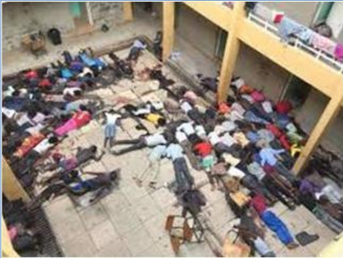
In memory of victims of the Garissa University massacre ( with apologies )