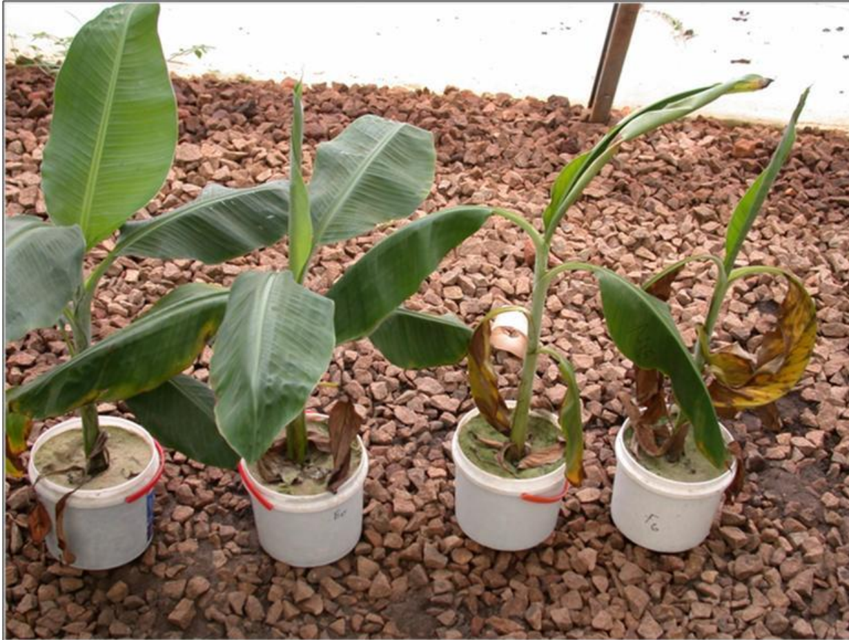
Fusarium oxysporum V5w2 a Misidentified Pathogen (Ochieno, 2010)